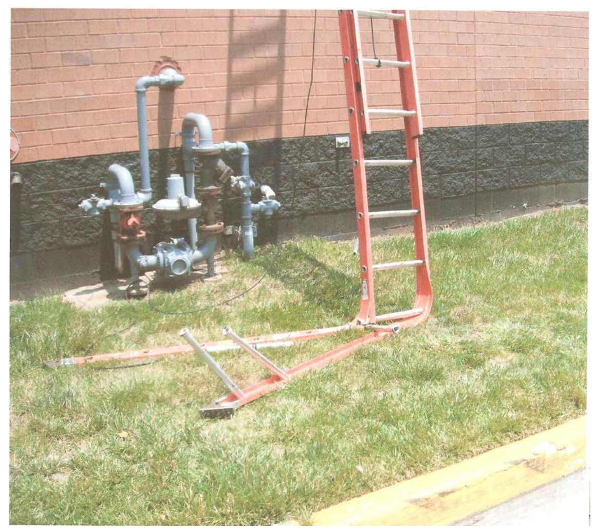
The lower section of the ladder failed