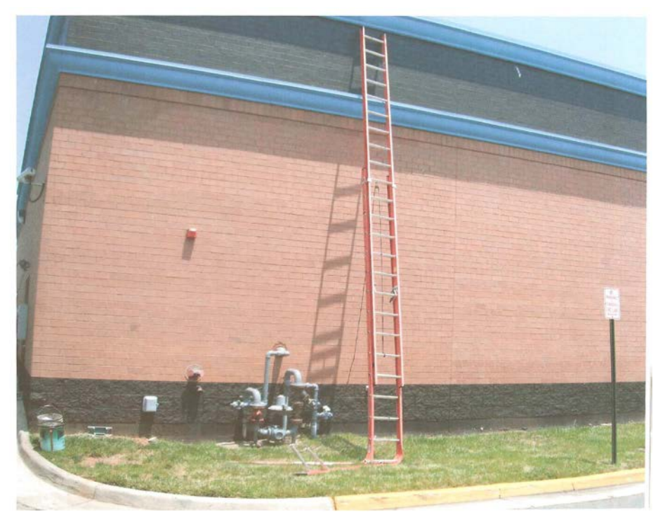
Ladder collapsed – worker was able to grab on to the leading edge of the building

As the technician was climbing the ladder he felt the ladder start to give from underneath him. He was able to reach and hold on to the roof edge as the ladder collapsed. The second technician was able to get another ladder from their service truck, set the ladder up and get the first technician down safely without incident.