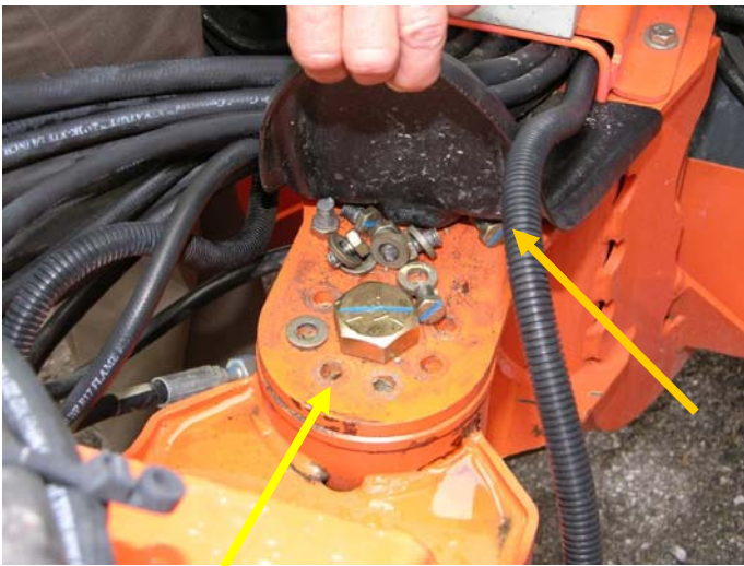
* Picture of cover plate and sheared bolts