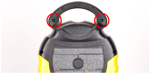
With Tamper Evident Paint

MSA Corporate Center 1000 Cranberry Woods Drive Cranberry Township, PA 16066 800.MSA.2222 www.MSAafety.com