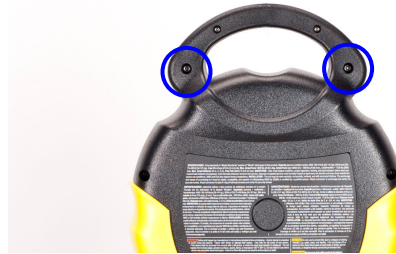
Without Tamper Evident Paint

IMPORTANT: Please be sure that your units are MSA Workman SRL 30 ft. or 50 ft. Self-Retracting Lanyards, and not MSA Workman PFL Personal Fall Limiters. If you have any questions on what you have, please contact your local distributor or go to the MSA contact information at the end of this notice and contact MSA Customer Service.